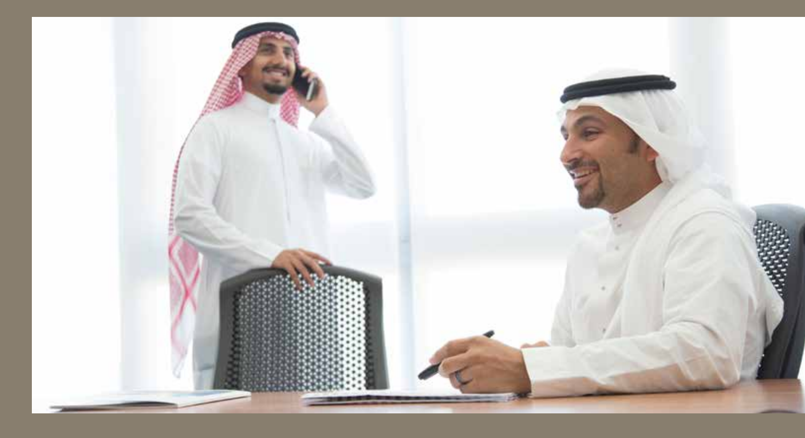
Discretionary Portfolio Management Advisory