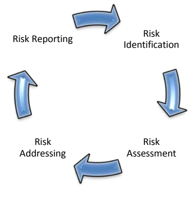
Figure 1 - Risk Management lifecycle

The Risk Management Framework which SC relies on is a well-proven methodology wherein all activities giving rise to risk are identified, measured, managed and monitored. Thus, risk management may be viewed as a "lifecycle" that includes the following four cycles: